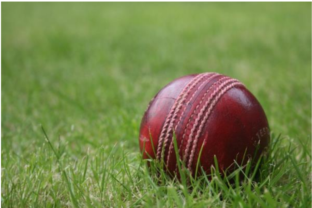
The goldbeaters Match