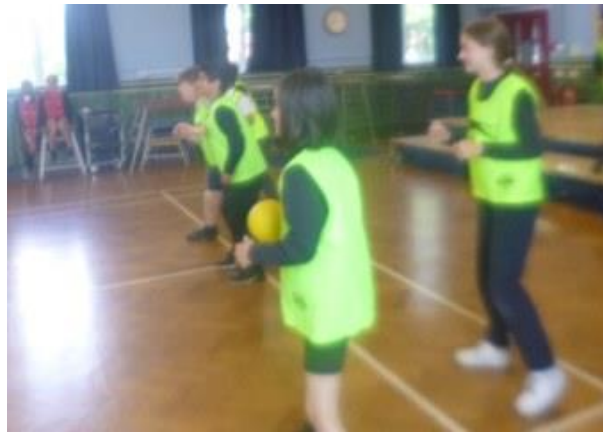
Cricket match Monday 21st June